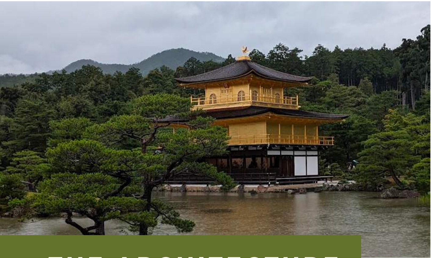
Kinkaku-ji (金閣寺), Kyoto