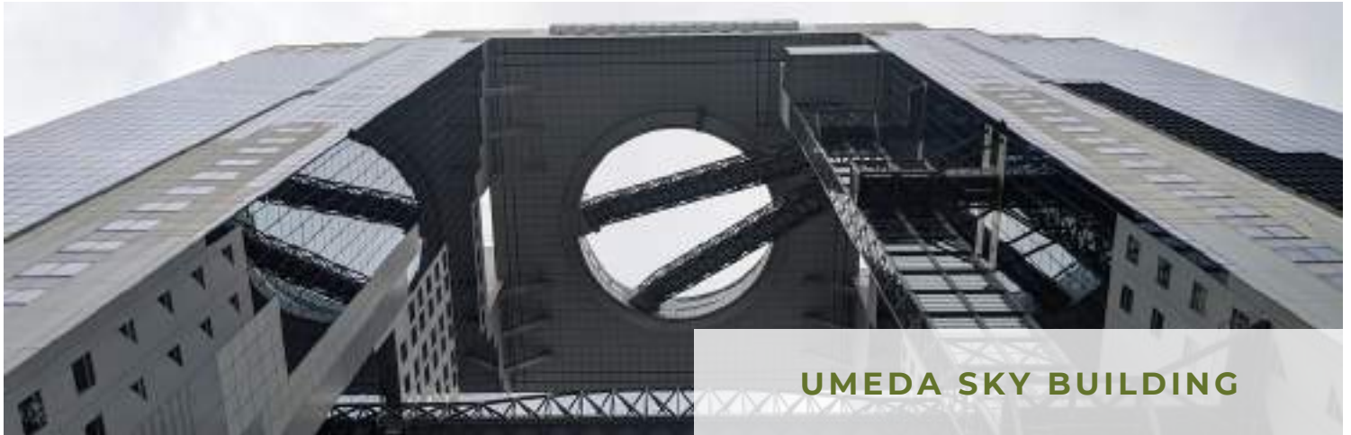
UMEDA SKY BUILDING

This iconic building consists of two forty-story towers that are connected at the top by a rooftop observatory, The Kuchu Tien Observatory which offers panoramic views of the city. Considered a marvel of contemporary architecture, the building's design also incorporates elements of traditional Japanese architecture, including a central courtyard that serves as a hub for pedestrian traffic and provides a sense of tranquillity amidst the hustle and bustle of the city.