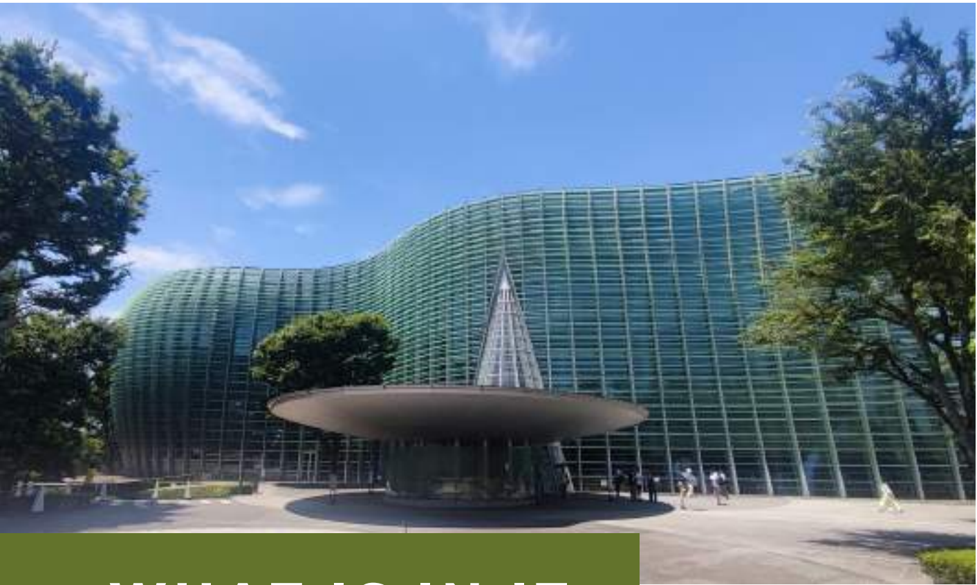
The National Art Centre, Tokyo