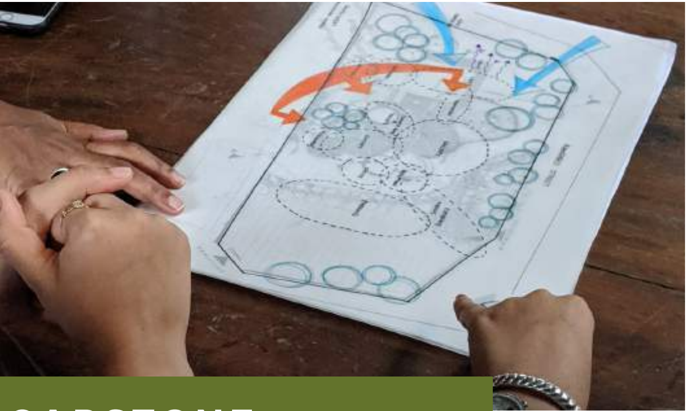
Project work by the October 2019 batch - A pop up pavilion design