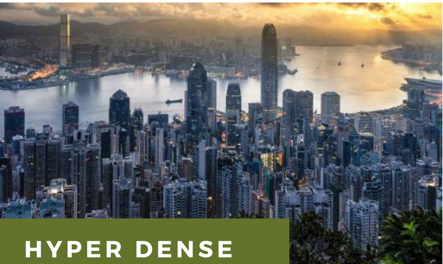
Hong Kong skyline