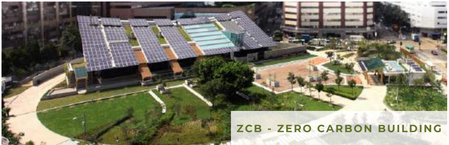
ZCB - ZERO CARBON BUILDING

The base of the building serves as a vast "urban lounge," fostering social gatherings and encouraging exchanges. The space also features a mix of indoor and outdoor green areas, providing stunning views of the surrounding countryside and strengthening the building's connection to the city.