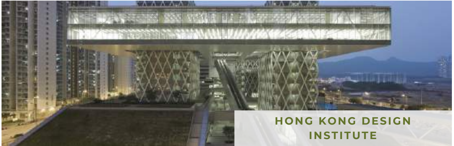
HONG KONG DESIGN INSTITUTE

Hong Kong Design Institute presents a fresh perspective on urban design by reimagining the built environment in a way that encourages social interaction. Traditionally, social interactions in urban areas tend to decline as one moves upwards, but this project challenges this notion by incorporating different levels of interaction within the building. One section of the program adds height to the structure, creating new opportunities for social connection.