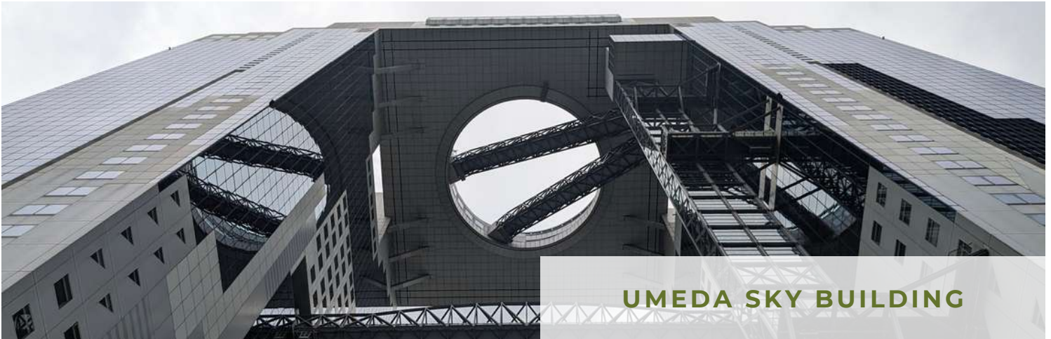
UMEDA SKY BUILDING

This iconic building consists of two forty-story towers that are connected at the top by a rooftop observatory, The Kuchu Tien Observatory which offers panoramic views of the city. Considered a marvel of contemporary architecture, the building's design also incorporates elements of traditional Japanese architecture, including a central courtyard that serves as a hub for pedestrian traffic and provides a sense of tranquillity amidst the hustle and bustle of the city.