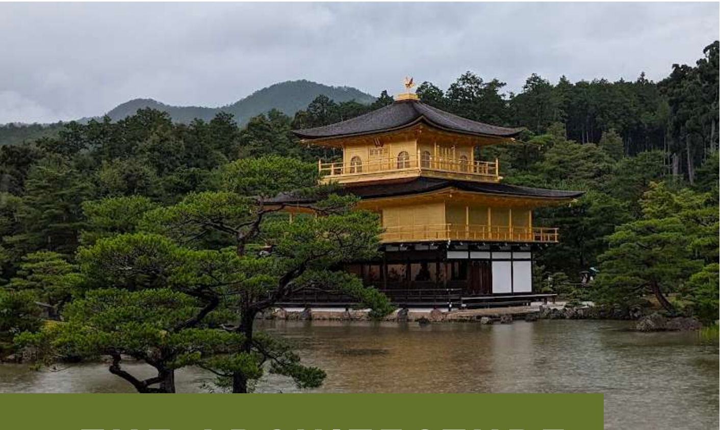
Kinkaku-ji (金閣寺), Kyoto