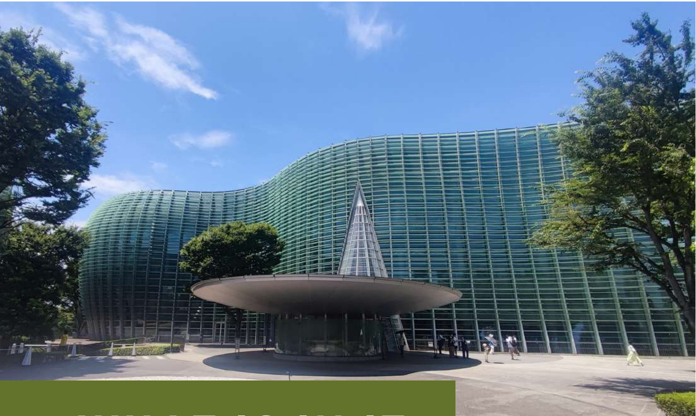
The National Art Centre, Tokyo