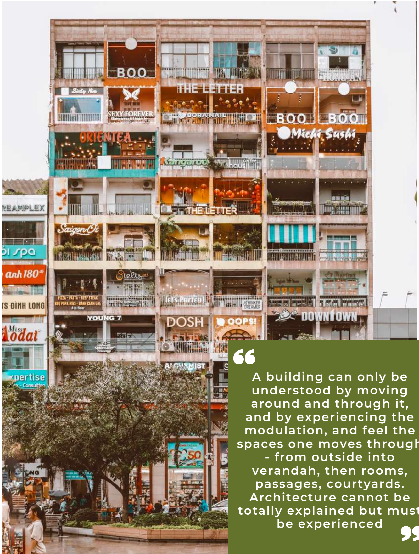
The Apartment Cafe on 42 Nguyen Hue

WE ADHERE TO WORK TOWARDS THE SUSTAINABLE DEVELOPMENT GOALS