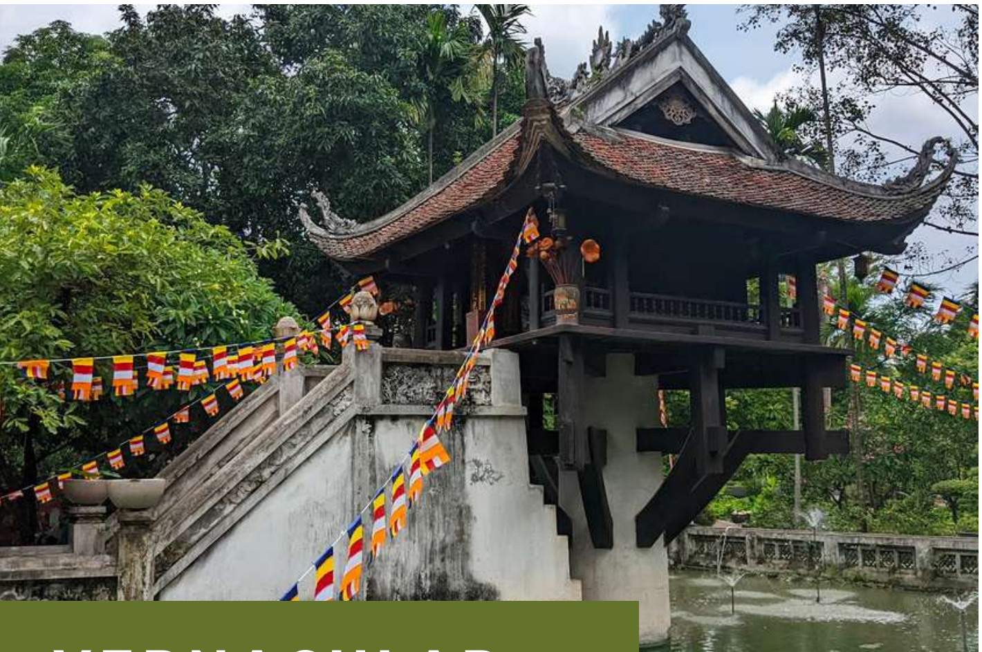
One Pillar Pagoda, Hanoi