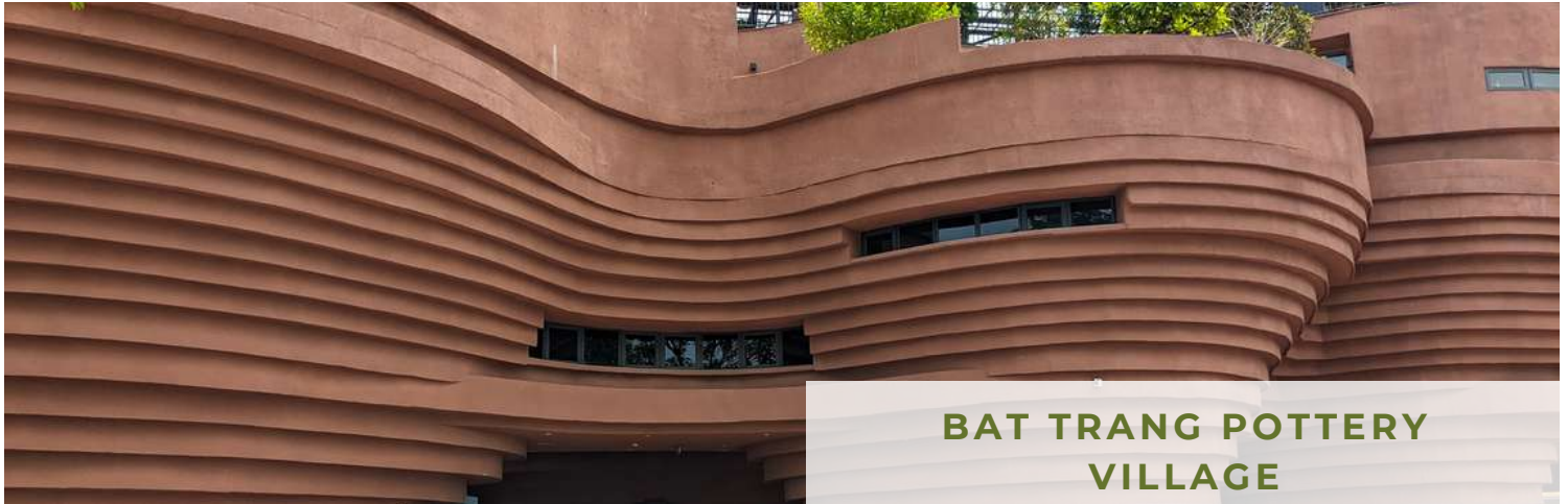
BAT TRANG POTTERY VILLAGE

Bat Trang, a village renowned for its ceramics since the 11th century, boasts a unique porcelain style developed over generations. Most households still engage in crafting these high-quality ceramics. The Bat Trang Pottery Museum, by 1+1>2 Architects, celebrates this heritage by showcasing artisans' work, village history, and pottery-making techniques.