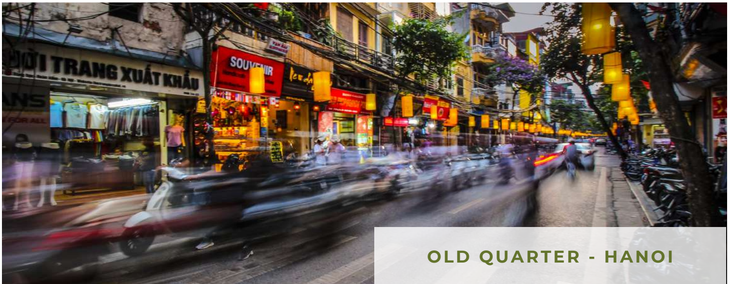
OLD QUARTER - HANOI

A versatile space blending exhibition halls, a cafe lounge, retail areas, and a client experience center. The design preserves the historical villa's facade while introducing a modern two-story steel and glass structure connected by a striking loop staircase. Kinetic sculptures serve as shading and landmarks. During renovation, the villa's rich history, seen in layers of paint, arch gates, and diverse brick types, was uncovered, highlighting the city's cultural heritage in every brick.