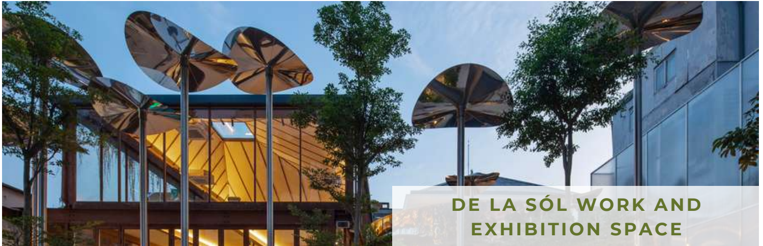
DE LA SÓL WORK AND EXHIBITION SPACE

A versatile space blending exhibition halls, a cafe lounge, retail areas, and a client experience center. The design preserves the historical villa's facade while introducing a modern two-story steel and glass structure connected by a striking loop staircase. Kinetic sculptures serve as shading and landmarks. During renovation, the villa's rich history, seen in layers of paint, arch gates, and diverse brick types, was uncovered, highlighting the city's cultural heritage in every brick.