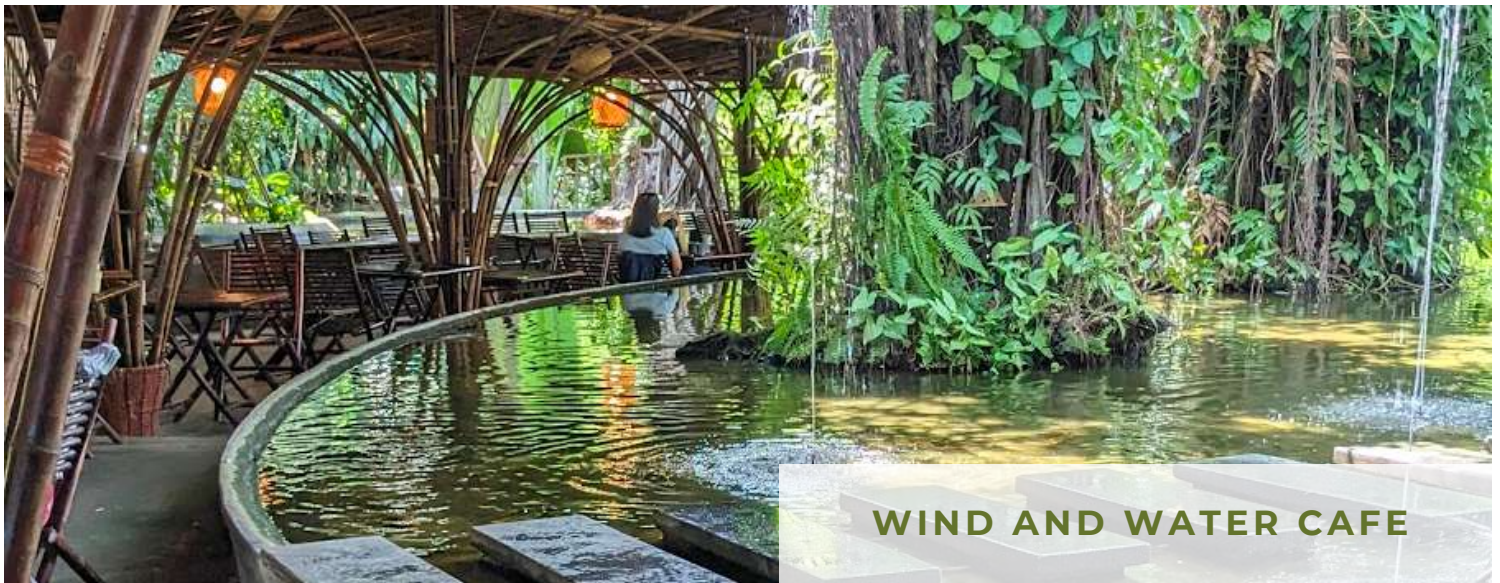
WIND AND WATER CAFE

The architects collaborated with experts and locals to create an open, community-supported space with commercial functions. This museum aims to preserve the craft's cultural significance and ensure its continuity.